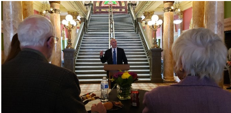
Governor Greg Gianforte