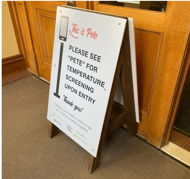
Plenty of signage all throughout the Capitol