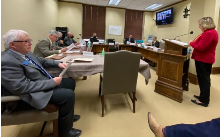
Lt. Governor Juras spoke in Senate Ag Committee